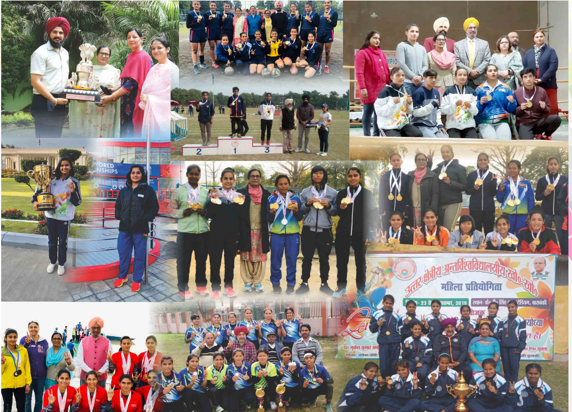
Teams of Guru Gobind Singh College for Women clinched many Winner's Trophies